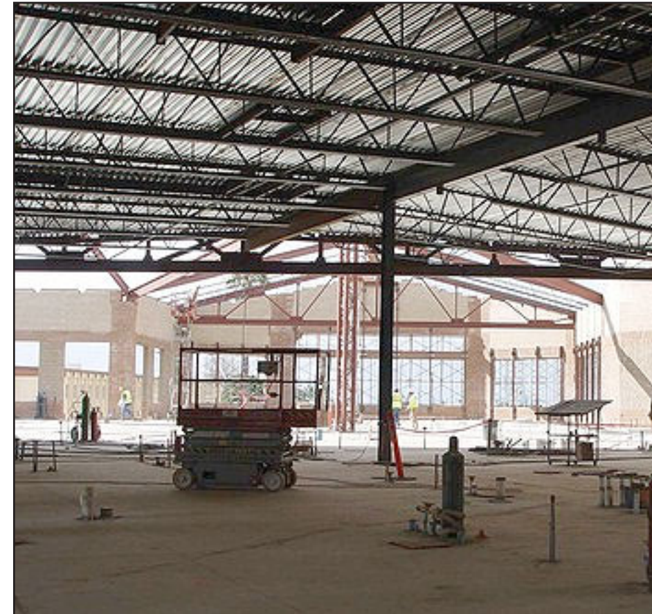
A mess hall with space for more than 700 Marines is being built at Camp Pendleton. The base plans to spend $2.7 billion to build 64 facilities; the stimulus package could lead to more construction.

of troops coming home, so the only way you'll be able to accommodate them is to build more military housing," he said. "You're going to fix them up in a couple